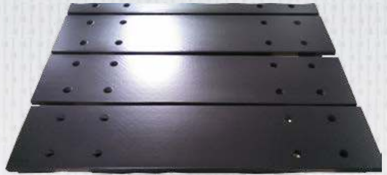
Splice Plate Close Up

The polyurethane matrix fiber reinforced pultruded wale splice plate has been designed to transfer 100% of the moment through thermoplastic and wood wale splices used extensively for bridge and asset fendering.